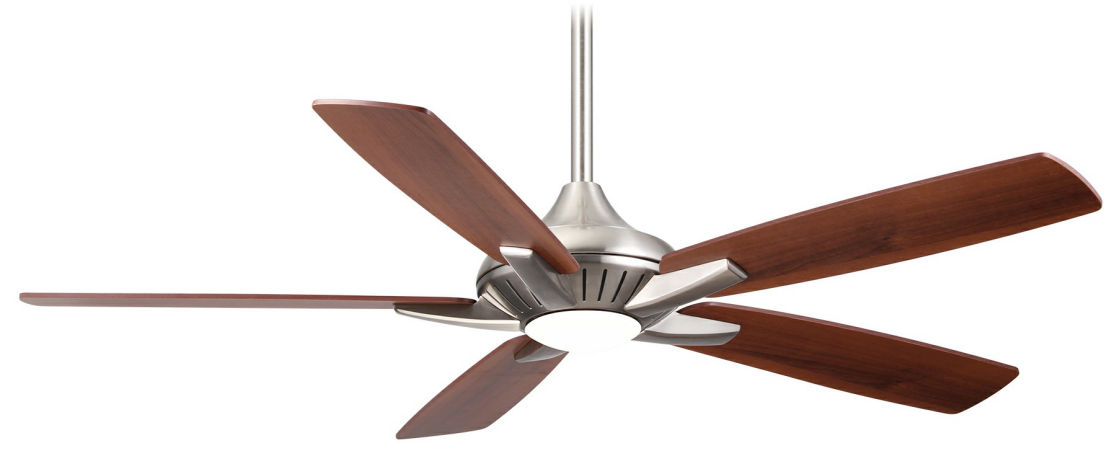
Reversible Blades - Dark Walnut