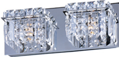
E23252-20PC Bangle 2-Light Bath Vanity